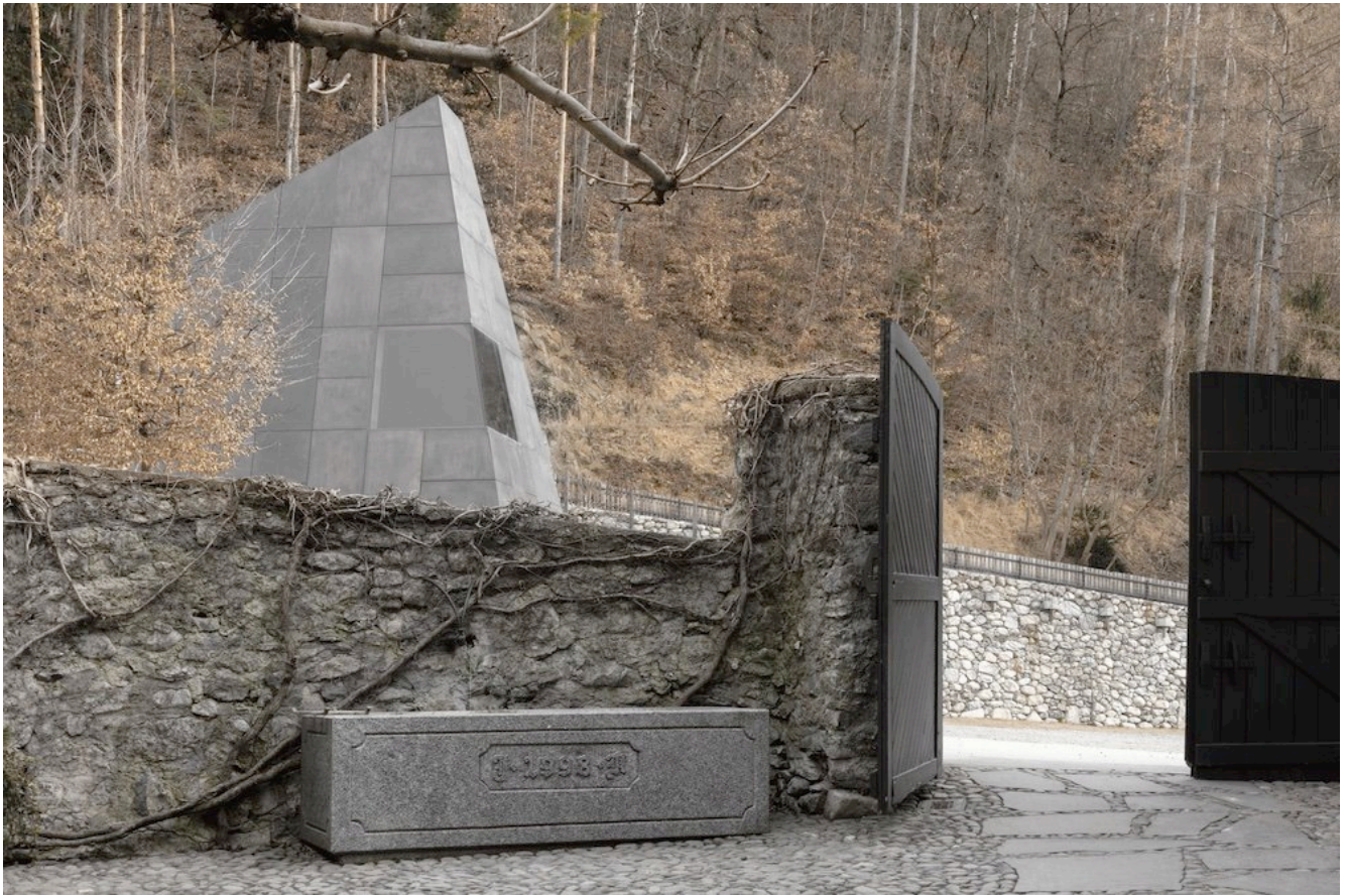
Cantina Pacherhof by Bergmeisterwolf studio

The Cantina Pacherhof by Bergmeisterwolf studio in South Tyrol largely extends underground. Inspired by traditional farmhouses, a pyramidal tower at the centre of the estate is clad in panels of darkened bronze that will change colour over time, like the surrounding rocks and Alpine skyline. The building houses the laboratory and a room for wine tasting on the first floor, while wine production begins in the basement.