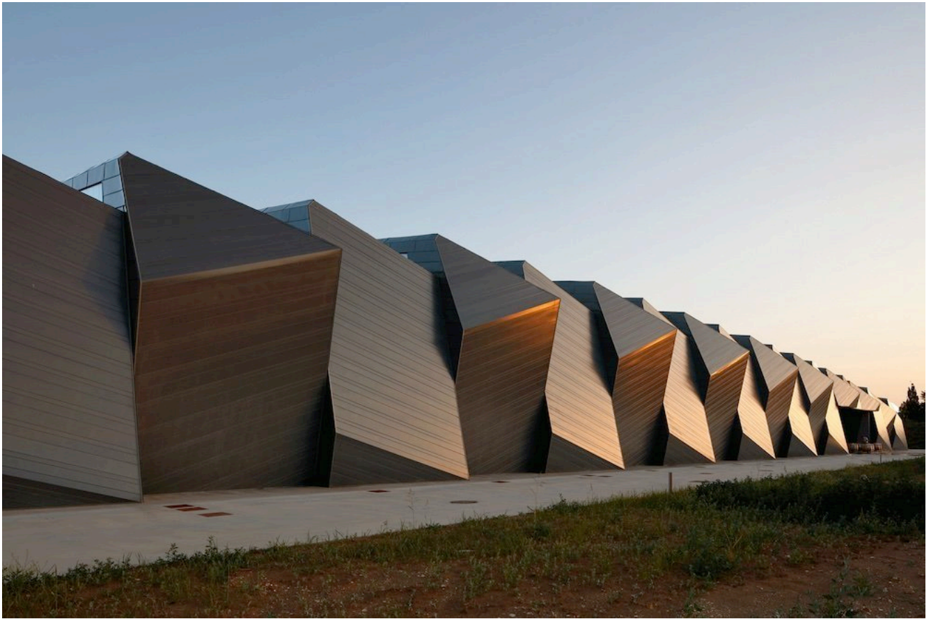
Cantina de Il Bruciato by Fiorenzo Valbonesi @ asv3 – Photo by ©Cornelia Suhan.

ASV3 Officina di Architettura created Antinori's winery Il Bruciato in Bolgheri in the province of Florence. The architecture's steeping angular silhouette is clad with zinc titanium sheets under a large laminated wood roof. The architects nurtured their creative concepts from ancient rural settlements integrated with today's specific environmental and technical construction parameters.