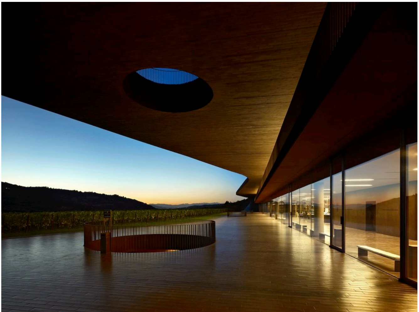
New Italian wineries – Cantina Antinori nel Chianti Classico by Archea Associati – Photo ©Pietro Savorelli.

ALVISI KIRIMOTO ARCHEA ASSOCIATI ARCHITECTURE ASV3 BERGMEISTERWOLF BRICOLO FALSARELLA CASABELLA CONCRETE FONDAMENTA GAETANO GULINO HUS ITALY LANDSCAPE MADE ASSOCIATI MAKUS SCHERER MARCO CAPPELETTI MATTEO CLERICI MERANO ART WEEK SANTI ALBANESE WINE WINERY ZITOMORI