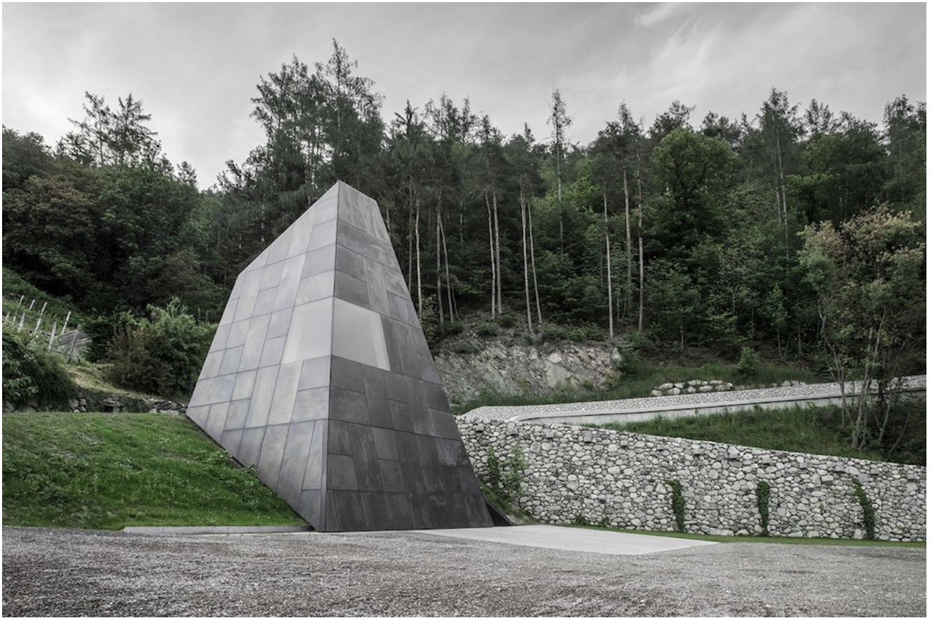
Cantina Pacherof by Bergmeisterwolf studio – Photo by ©Gustav Willeit.

"Wine is a very intriguing product. [Like architecture,] it includes all the circumstances, a mix of temporary and historical conditions and human philosophy." Say Maurizio Zito and Hikaru Mori of ZITOMORI studio. "Wine has a unique and special attribute, and each vintage is different; it lasts and continues to evolve. We're a little part of history and the environment, but architecture and wine stand the test of time. Our Masseto winery in Tuscany will continue to evolve."