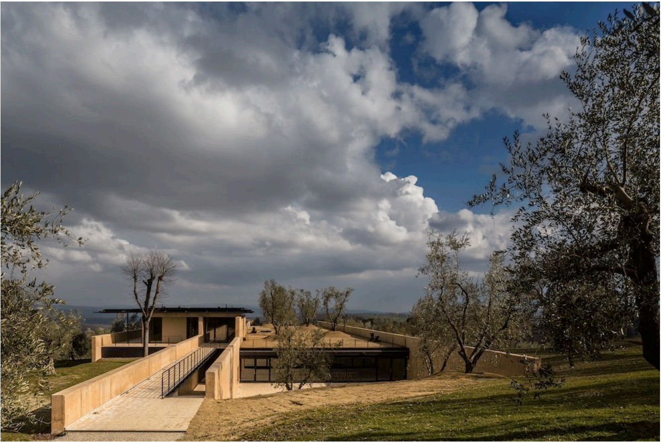
Cantina Poderenuovo by Avisi Kirimoto

Italian and Japanese principles merge and coexist in Alvisi Kirimoto's Podernuovo winery for Bulgari at San Casciano dei Bagni in the province of Siena. The architecture was conceived as an extension of the arable landscape and labor culture. The building emerges from the ground with four parallel concrete walls of varying heights made of exposed concrete mixed with pigments from the Sienese soil.