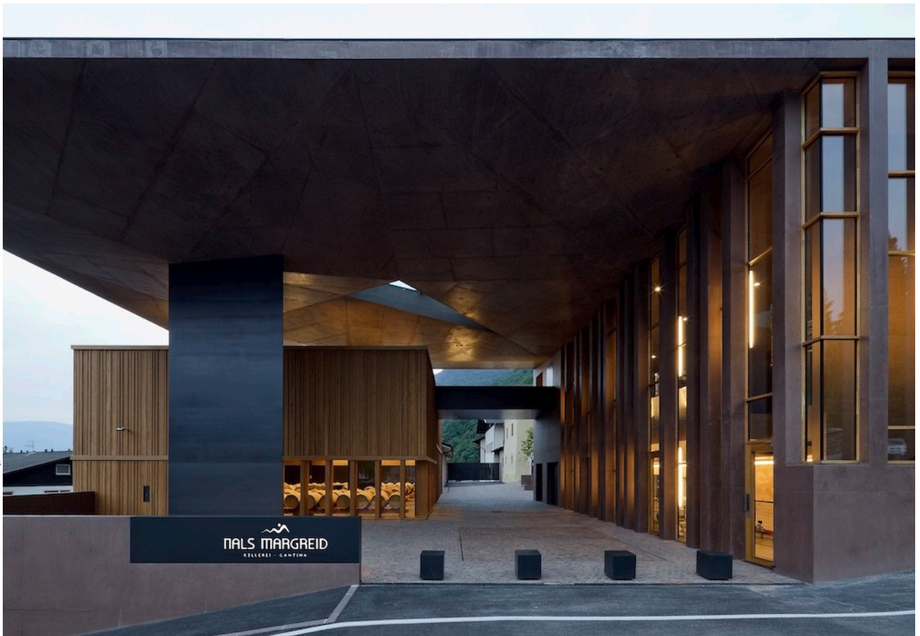
Nals Magreid by Markus Scherer – Photo by © Bruno Klomfar.

The Nals Margreid winery complex by Markus Scherer is embedded in the Italian South Tyrol scenery of wine and fruit. The village and cantina harbor the different winemaking areas under a single roof and on several levels, leaving the barrel room visible on the ground floor.