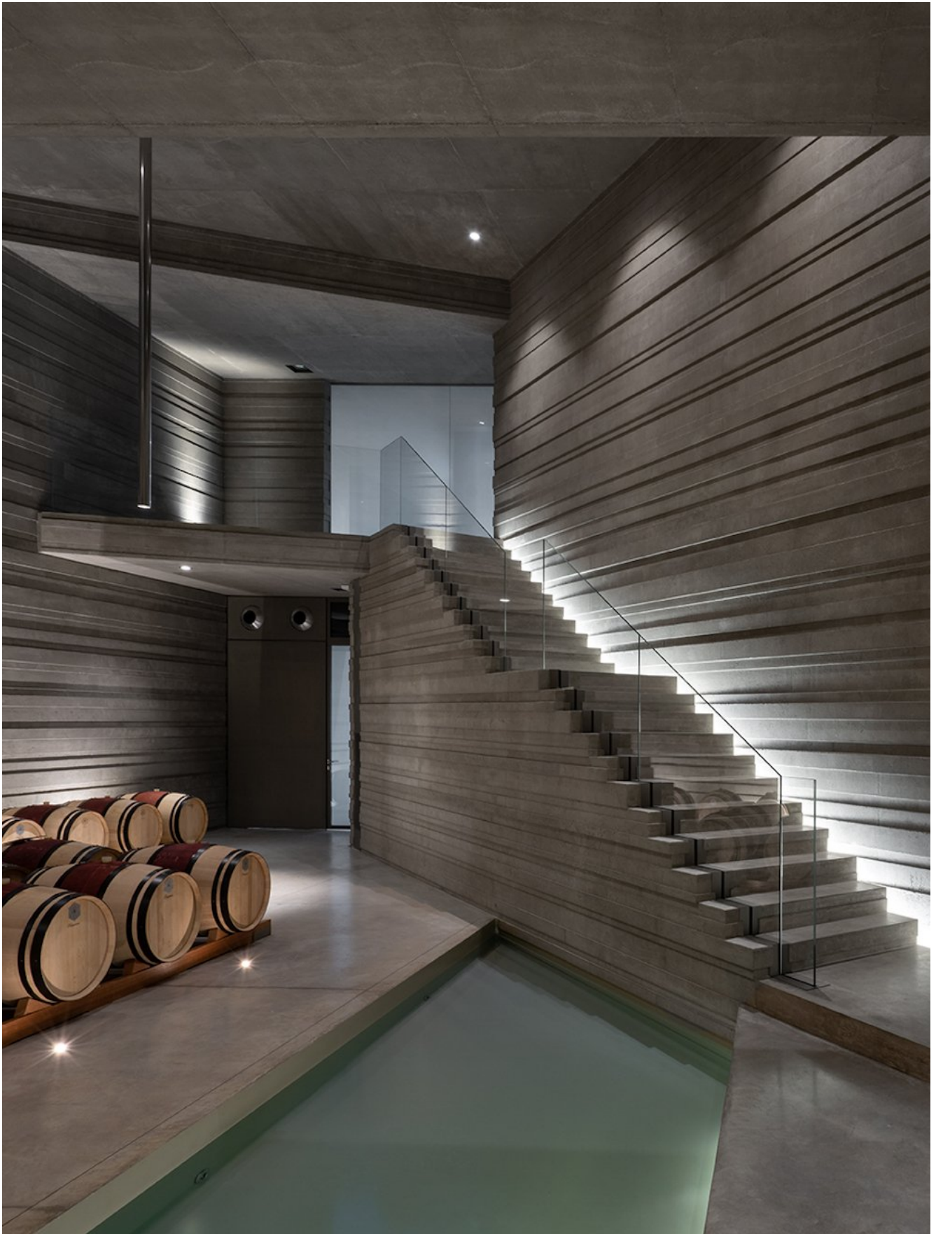
Cantina Masseto by ZITOMORI – Photo by ©Andrea Martiradonna.

The Masseto winery by ZITOMORI in the Leghorn province is only visible from the inside and is conceived as a cavernous concrete quarry. The 'negative' architecture is obtained from extracting volumes of enormous mass rather than construction. "We chose cast-in-place reinforced concrete as a primary construction material, to symbolize a monolithic mass, as a local blue clay." Explain the architects. Horizontal lines on the concrete walls evoke rocks' geological stratifications.