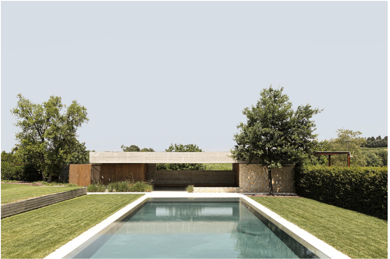
Cantina Gorgoby Bricolo+Falsarella

Local stones are the main material of the Gorgo winery designed by Bricolo+Falsarella studio in Cuztoza, between Verona and Lake Garda. “Taking a cue from the vernacular heritage of the area, we have proposed a reinterpretation of the rural typology of the Brolo, a model of hybrid space between inside and outside that has persisted for centuries in the local countryside.” Explain the architects.