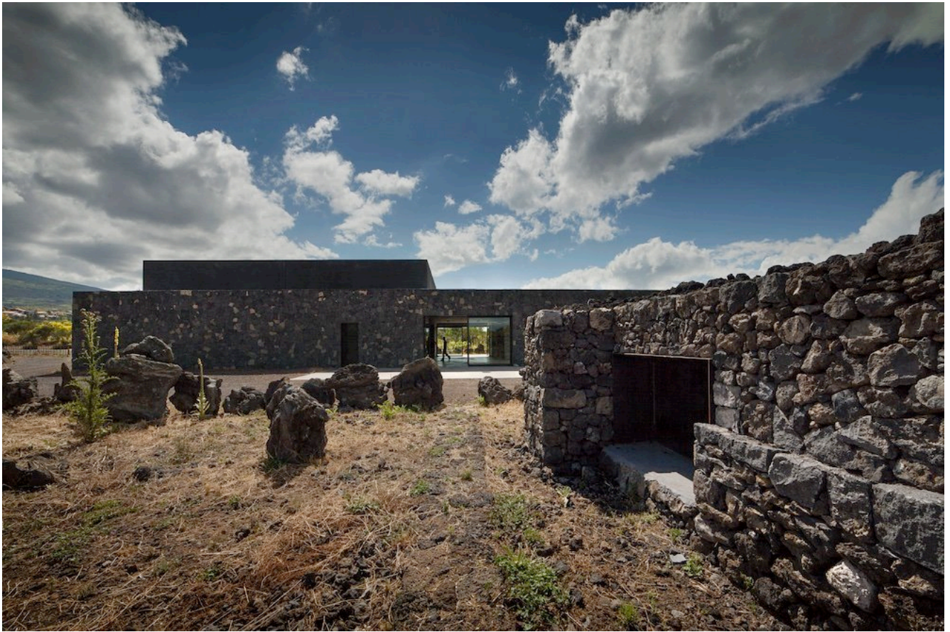
Cantina Planeta by Gaetano Gulino and Santi Albanese

On the fertile slopes of the Etna volcano, the Cantina Planeta Feudo di Mezzo by Santi Albanese and Gaetano Gulino enhances the dark landscape forged by lava flows and yellow flowering broom. Three simple buildings clad in lava stone dialogue with each other under intense skies and Mediterranean light.