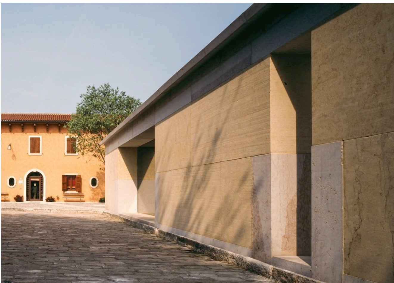
Cantina Gorgoby Bricolo+Falsarella

Photos by Kunst Merano Arte and the studios.