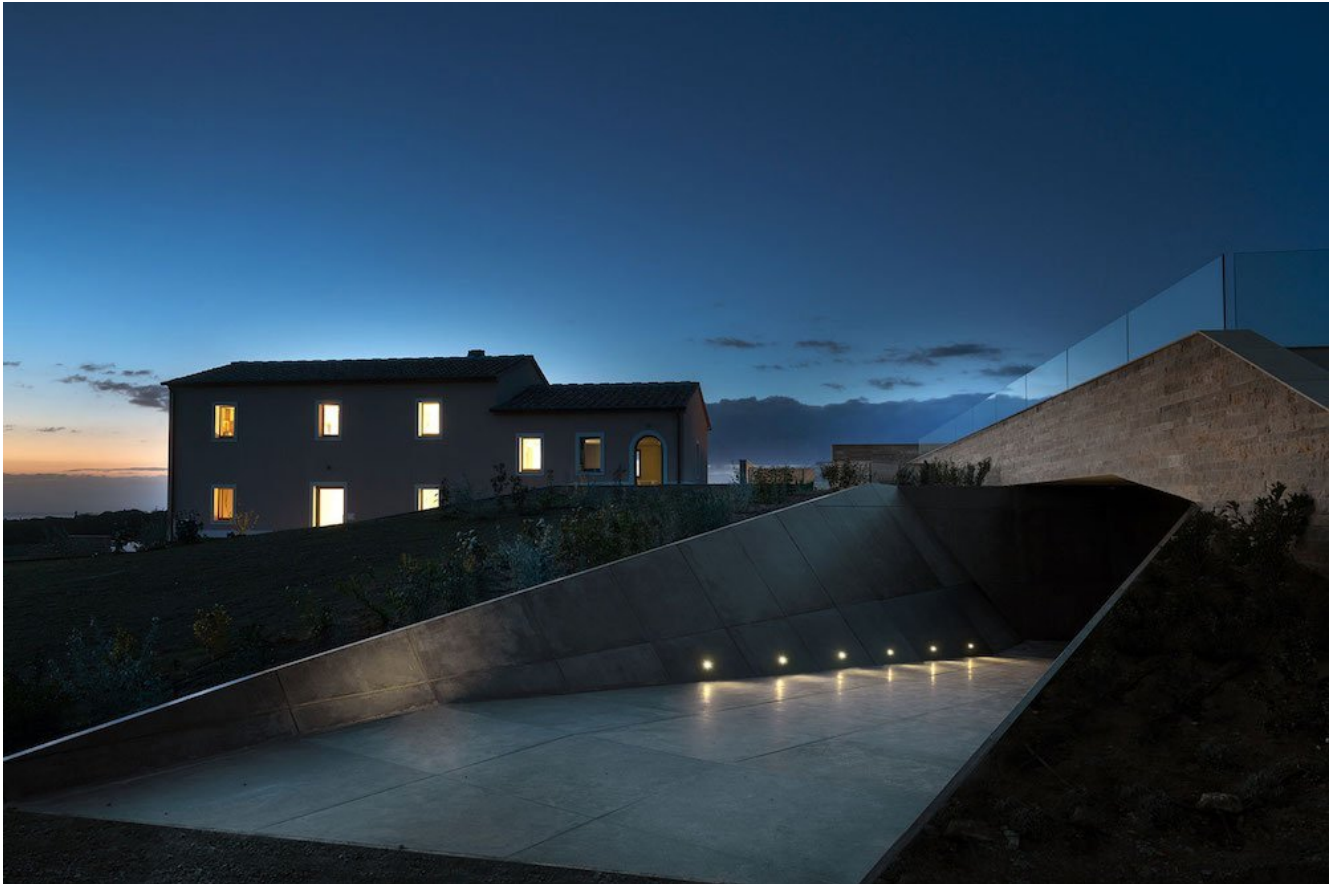
Cantina Masseto by ZITOMORI

With over 20.000 wineries open to the public, wine tourism is an essential component of the fine wine and food sector. Indeed, with 2.65 billion euros in 2020, it is the second tourist attraction Italy has to offer after art. "The sector's development has led winegrowers to identify architecture as the most suitable instrument to represent the originality of their vocation and the quality of their products." Explains co-curator Roberto Bosi.