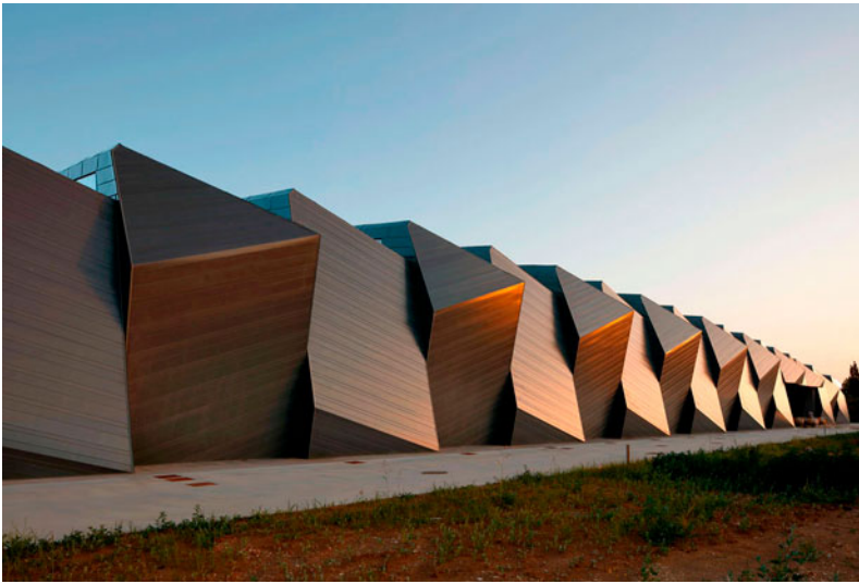
Fiorenzo Valbonesi, Cantina del Bruciato, Bolgheri.

You go from micro-perforated zinc-titanium sheet metal, to pigmented cement blocks, from glass towers to the elegant mimicry of helical vortices that rework the profiles of hillsides. An interesting typological adventure, traced by the volume Nuove Cantine Italiane (New Italian Wineries), which through a rich collection of photographs, drawings and short descriptions, presents eleven recent projects. Productive structures but also places that amaze and welcome, capable of attracting visitors and promoting alternative hedonistic tourism, far from the usual destinations.